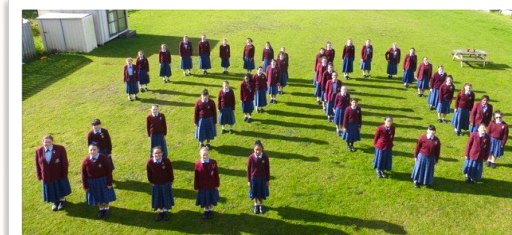
Fig 3: 20 Years of St. Dominics Girls' College