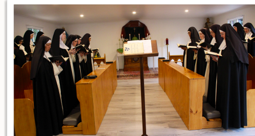
Fig 2: Sisters Singing the Divine Office